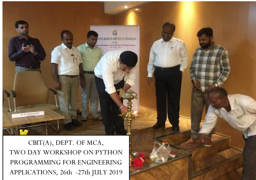
The Principal - CBIT, HOD of MCA, Speakers and faculty at the Inaugural of the Workshop

guided training, Access to Python power-points, research papers and other learning resources, Opportunity to interact with industry experts for career guidance. Total participants for the workshop were 85 (23 Staff members and 62 Students).