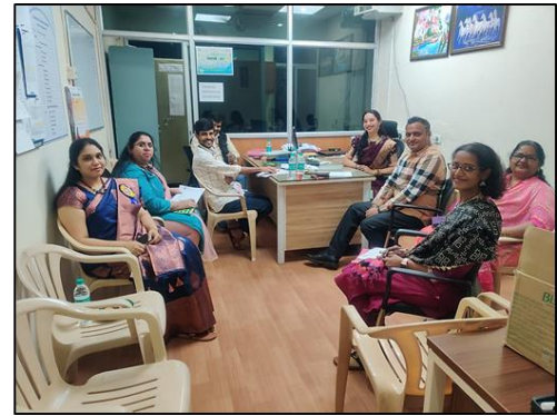
Alumni Meeting held at department of Chemical Engg on 25 th December 2024