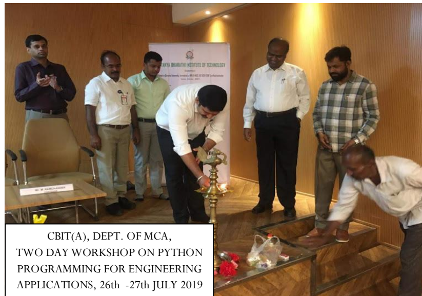
The Principal - CBIT, HOD of MCA, Speakers and faculty at the Inaugural of the Workshop