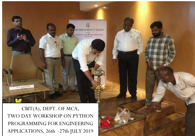
CBIT(A), DEPT. OF MCA, TWO DAY WORKSHOP ON PYTHON PROGRAMMING FOR ENGINEERING APPLICATIONS, 26th -27th JULY 2019