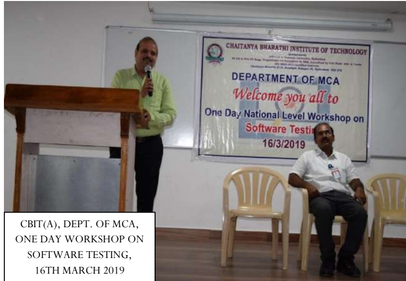
CBIT(A), DEPT. OF MCA, ONE DAY WORKSHOP ON SOFTWARE TESTING, 16TH MARCH 2019