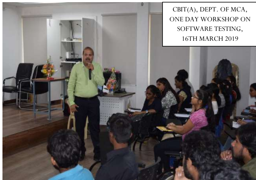
CBIT(A), DEPT. OF MCA, ONE DAY WORKSHOP ON SOFTWARE TESTING, 16TH MARCH 2019