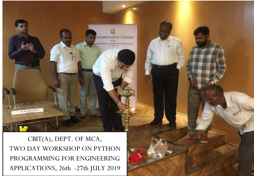
The Principal - CBIT, HOD of MCA, Speakers and faculty at the Inaugural of the Workshop