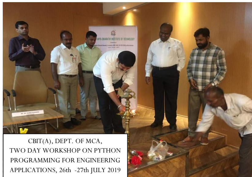
The Principal - CBIT, HOD of MCA, Speakers and faculty at the Inaugural of the Workshop