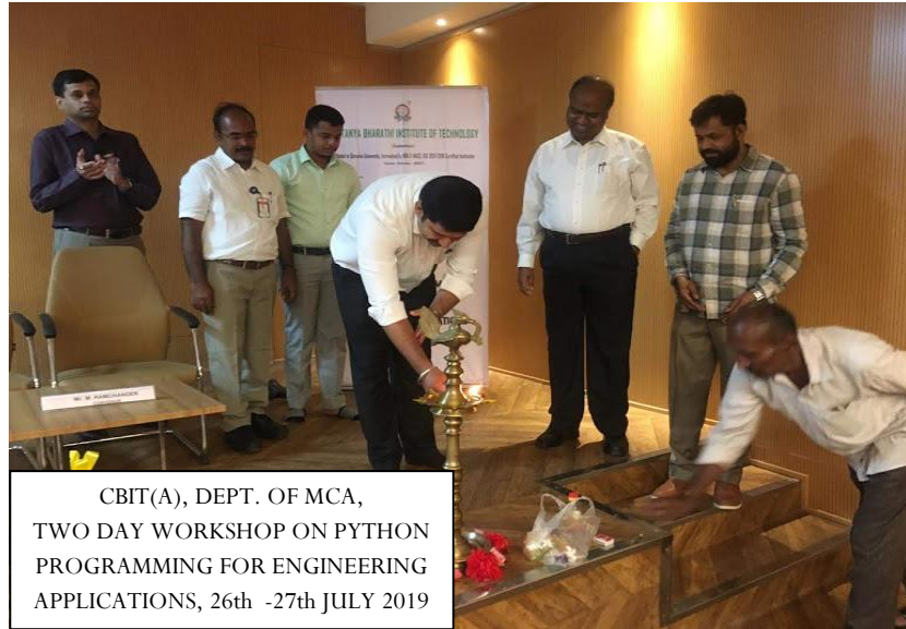
The Principal - CBIT, HOD of MCA, Speakers and faculty at the Inaugural of the Workshop