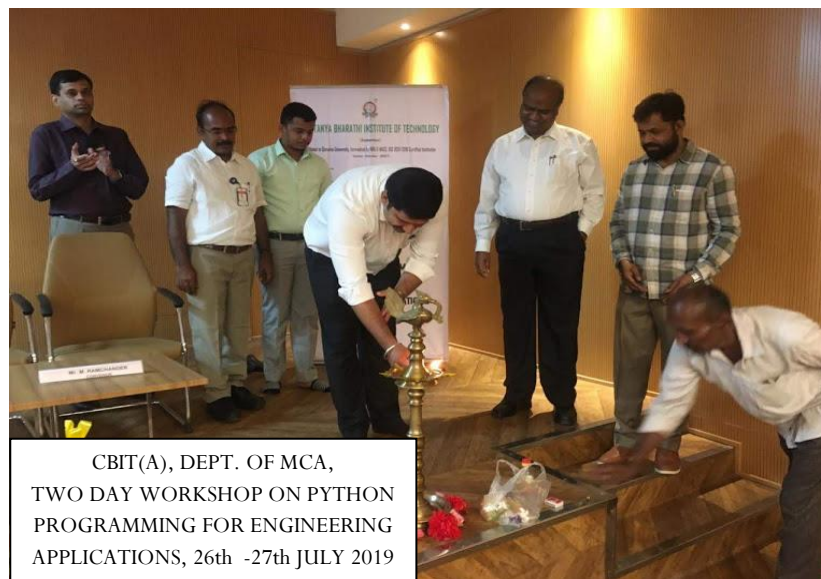
The Principal - CBIT, HOD of MCA, Speakers and faculty at the Inaugural of the Workshop