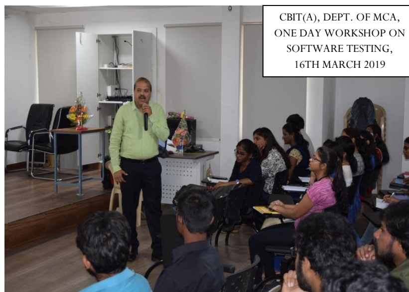
CBIT(A), DEPT. OF MCA, ONE DAY WORKSHOP ON SOFTWARE TESTING, 16TH MARCH 2019