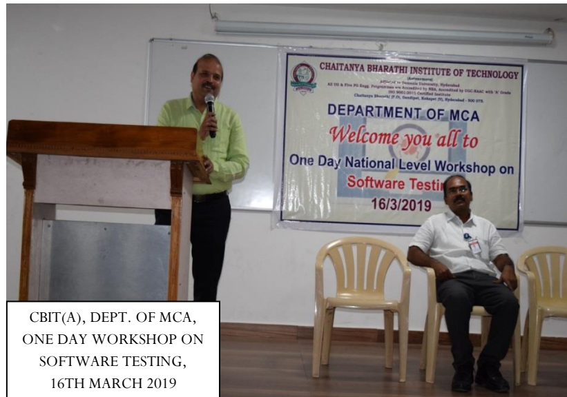
CBIT(A), DEPT. OF MCA, ONE DAY WORKSHOP ON SOFTWARE TESTING, 16TH MARCH 2019