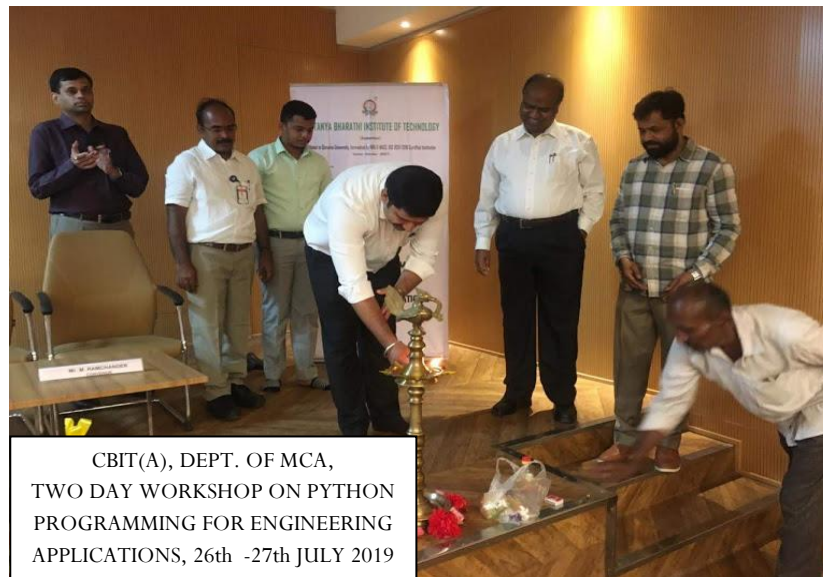
The Principal - CBIT, HOD of MCA, Speakers and faculty at the Inaugural of the Workshop