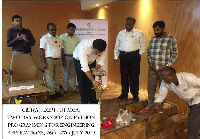
The Principal - CBIT, HOD of MCA, Speakers and faculty at the Inaugural of the Workshop