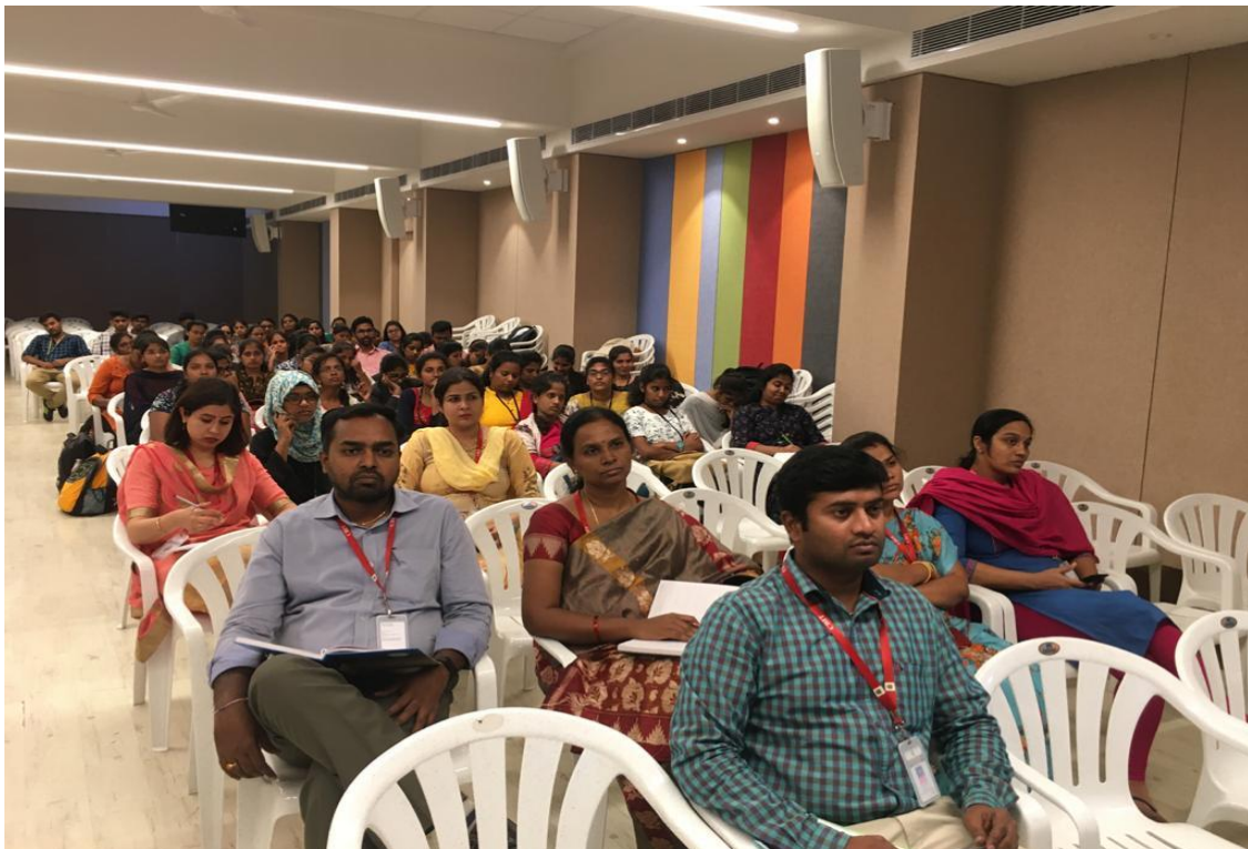
Management Students and Faculty Members listening to Knowledge-Driven Session