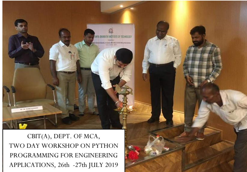
The Principal - CBIT, HOD of MCA, Speakers and faculty at the Inaugural of the Workshop