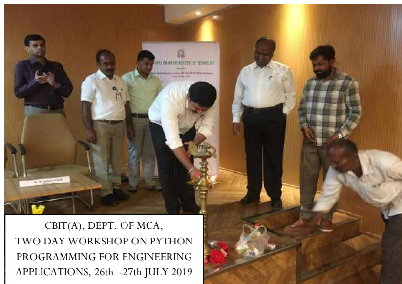
CBIT(A), DEPT. OF MCA, TWO DAY WORKSHOP ON PYTHON PROGRAMMING FOR ENGINEERING APPLICATIONS, 26th -27th JULY 2019