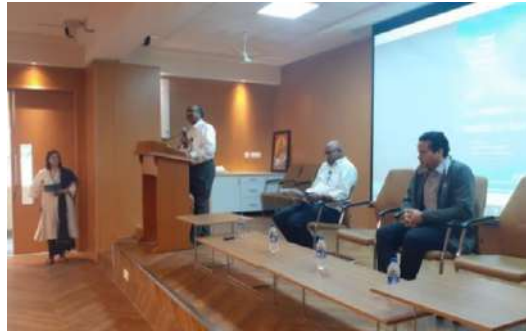
Principal, CBIT addressed the Gathering