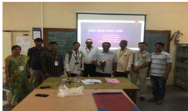
Guest lecture on “LED’s and Solar cells”