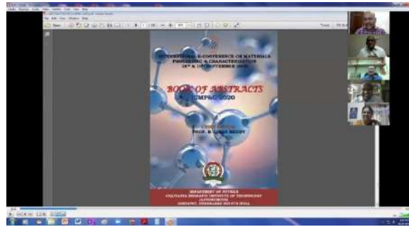
ICMP& C-2020 Book of Abstract