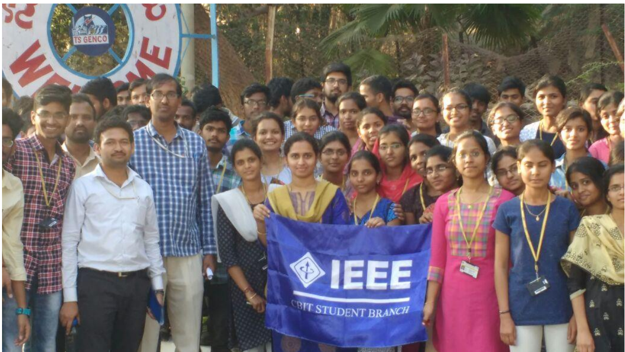
Nagarjuna Sagar Hydrel Power Plant Visit