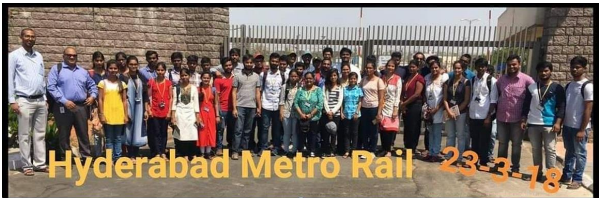
L&T Hyderabad Metro Rail Project visited by Students