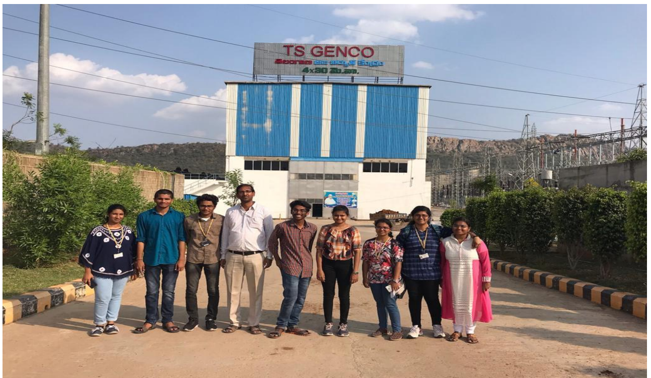
Visit to Pulichintala Hydrel Power Plant