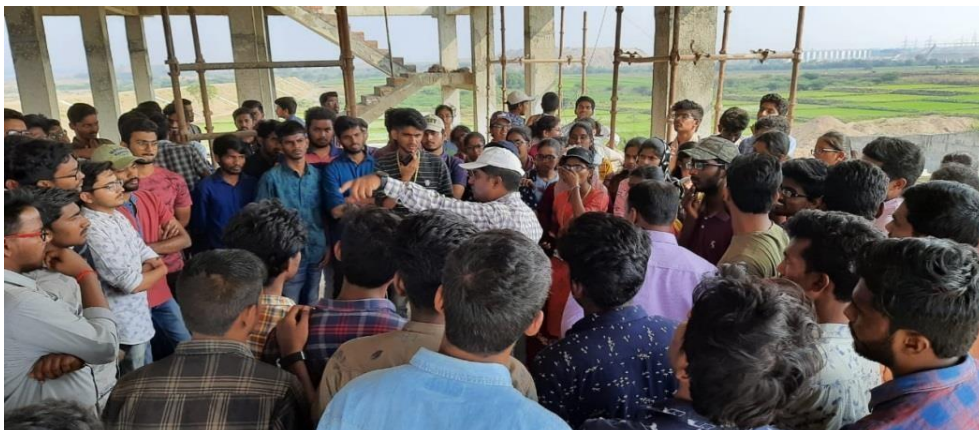
Sundilla Pump House, Kaleshwaram Lift Irrigation Scheme Project