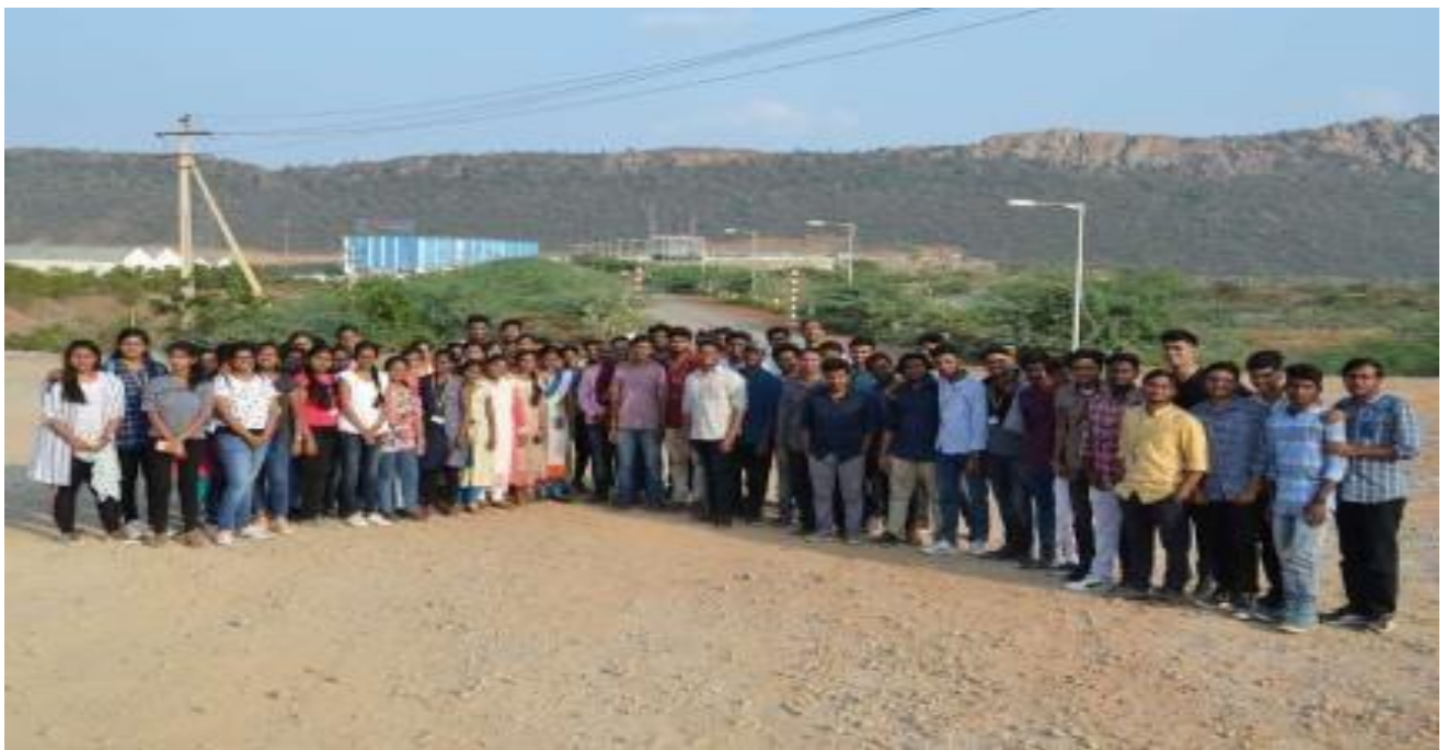
PCHES, Pulichintala, Kodad