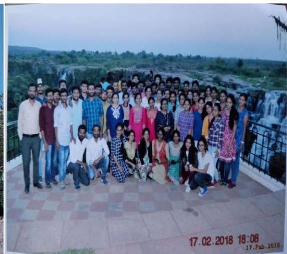
Nagarjuna Sagar Power Plant Visit