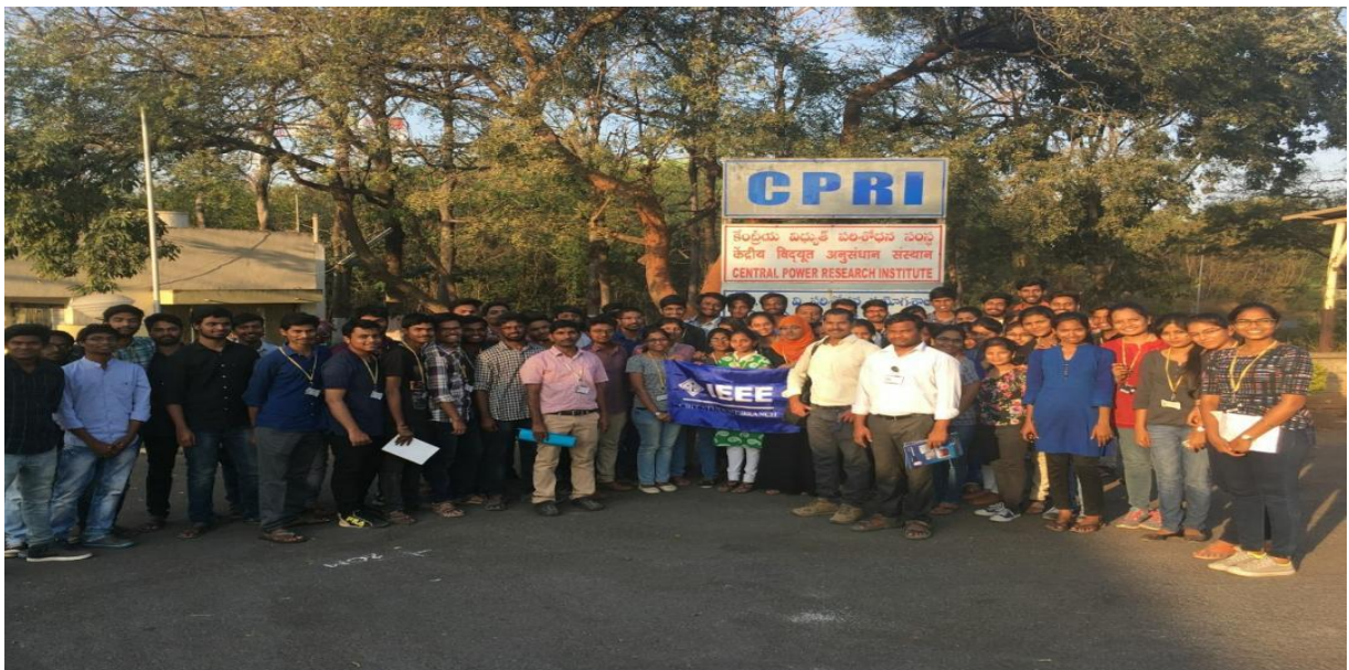
CPRI Industrial Visit at Uppal, Hyderabad.