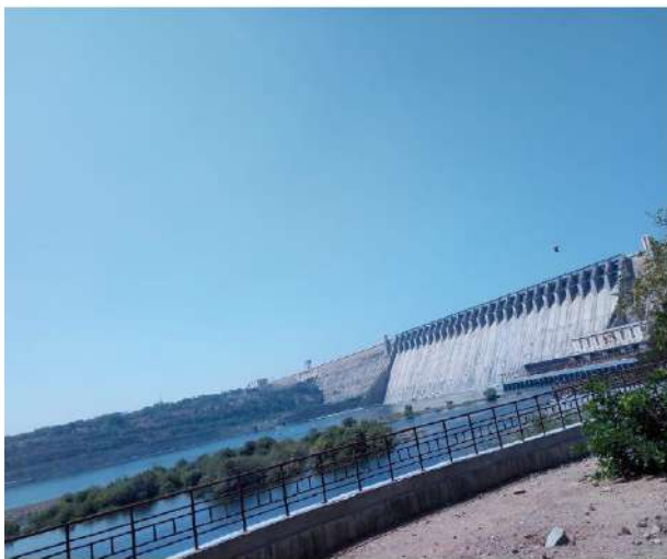
Nagarjuna Sagar Site visited by Students