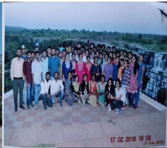
Nagarjuna Sagar Power Plant Visit