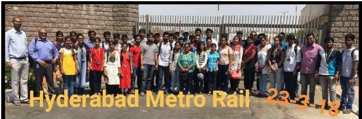
L&T Hyderabad Metro Rail Project visited by Students