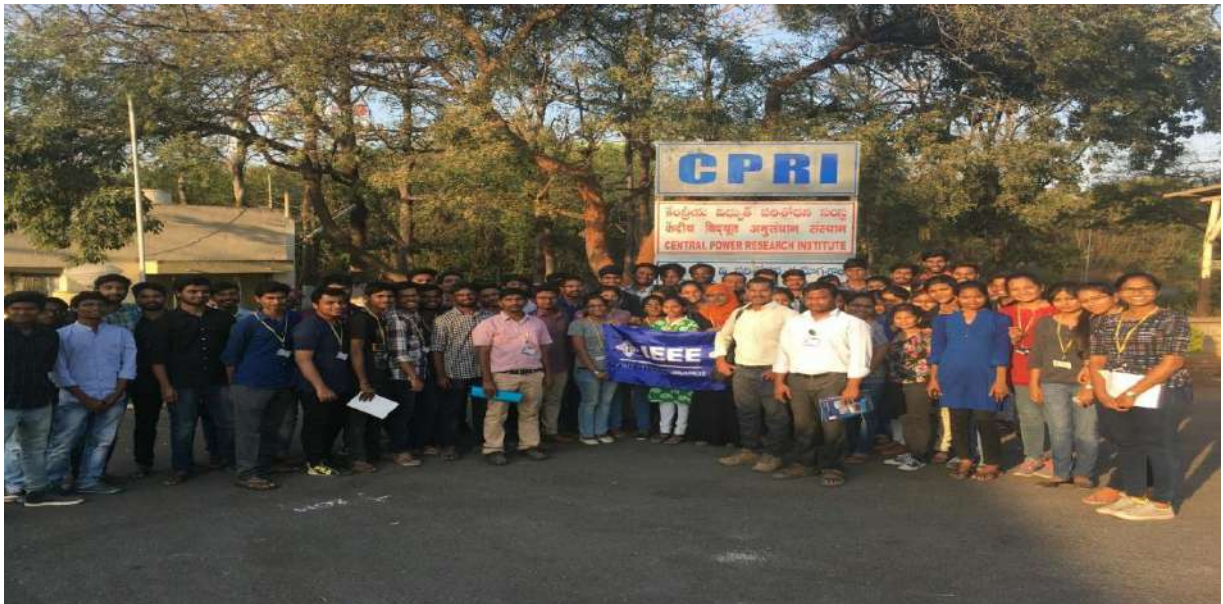
CPRI Industrial Visit at Uppal, Hyderabad.