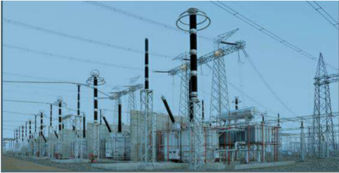
CPRI Testing Site Visited by Students