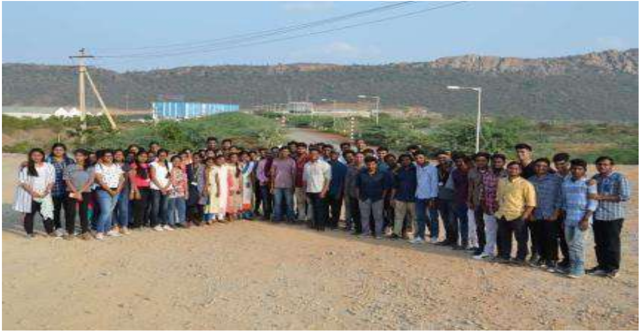
PCHES, Pulichintala, Kodad