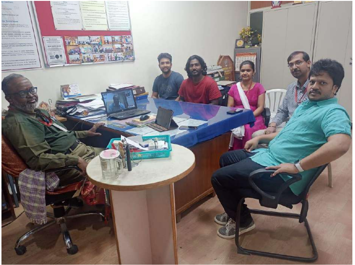
Alumni Interaction with HoD and Faculty in the HoD Chamber of EEE Dept. on 25/12/2021.