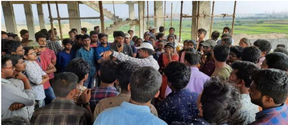
Sundilla Pump House, Kaleshwaram Lift Irrigation Scheme Project