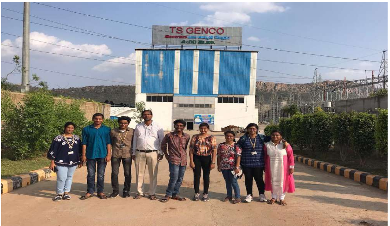
Visit to Pulichintala Hydrel Power Plant