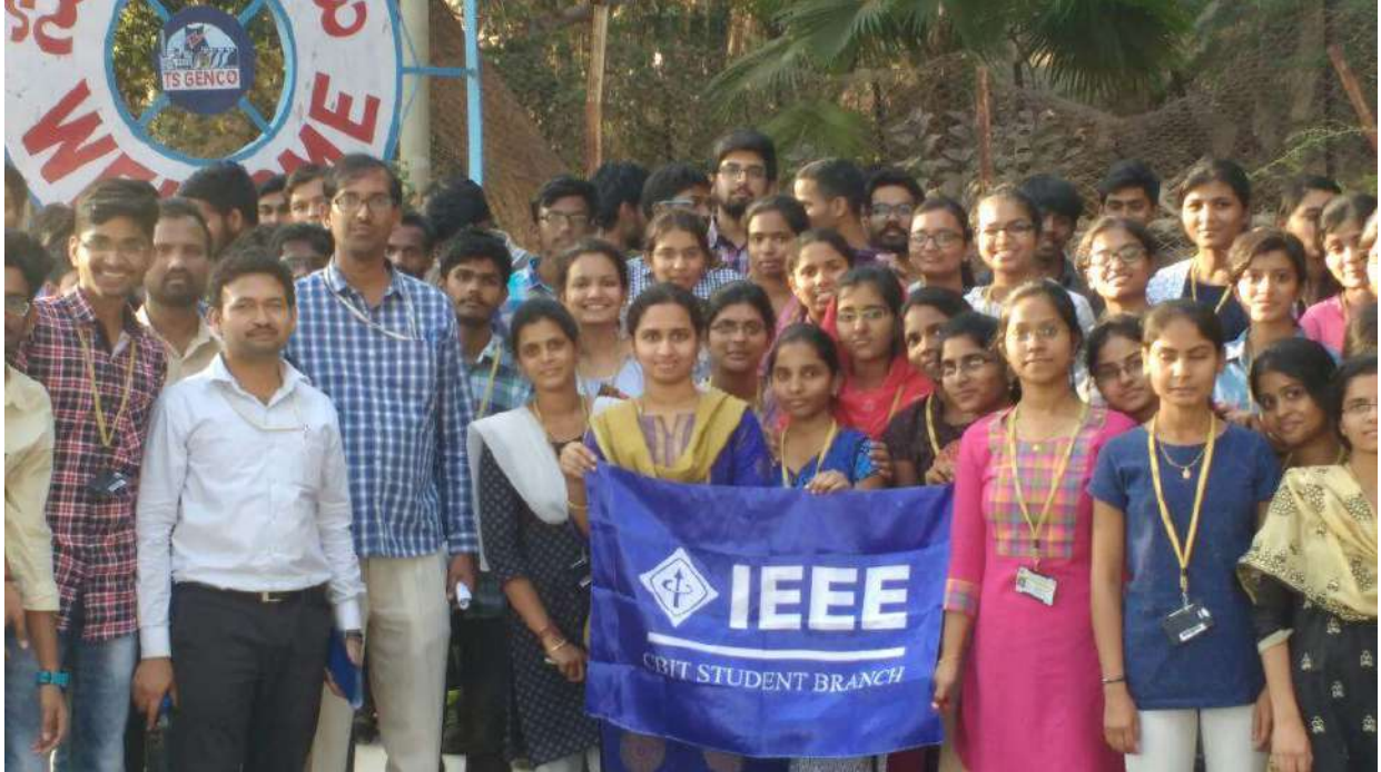
Nagarjuna Sagar Hydel Power Plant Visit