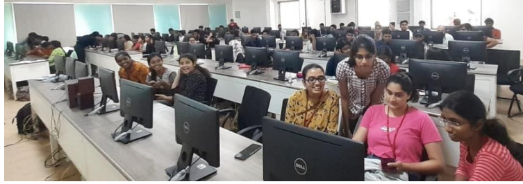
Students Participated in Microsoft Gaming Event.