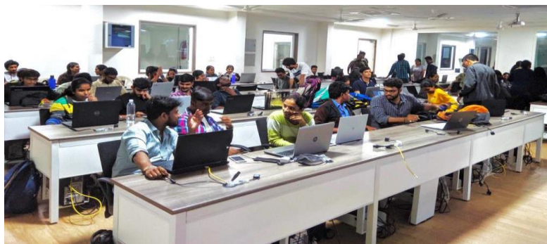
CBIT, Hacktoberfest Hackathon 2019 Training & Placement office, 25 th and 26 th October 2019