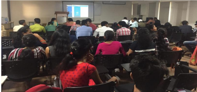
Participants Sharing their Ideas in Kony Hackathon