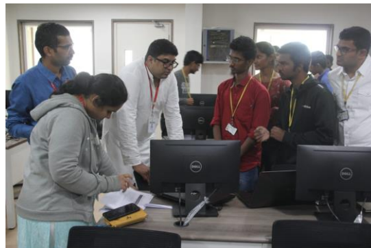
CSE Students interacting with the panel of Internal Hackathon 2020 and sharing their thoughts.