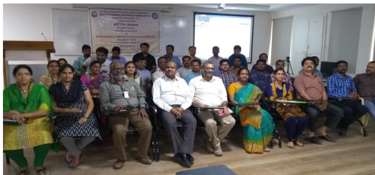
Short Term Training Program (STTP) on Development of Laboratory Instruction and Manual, Organized by NITTR Kolkata, CBIT C-203 on 4 th -8 th February 2019, (One Week).