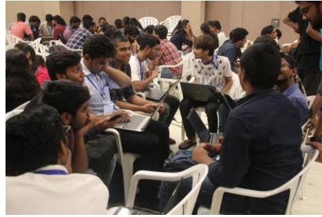
Participants working in Group activity of Django camp