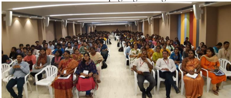
CBIT Students participated in cyber security campaigning fortnight orientation program