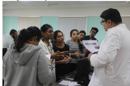
CSE Students explained the outcome of the idea of thought in Internal Hackathon 2020.