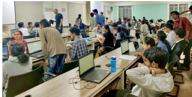
Students worked over night in Hacktoberfest Hackathon 2019.