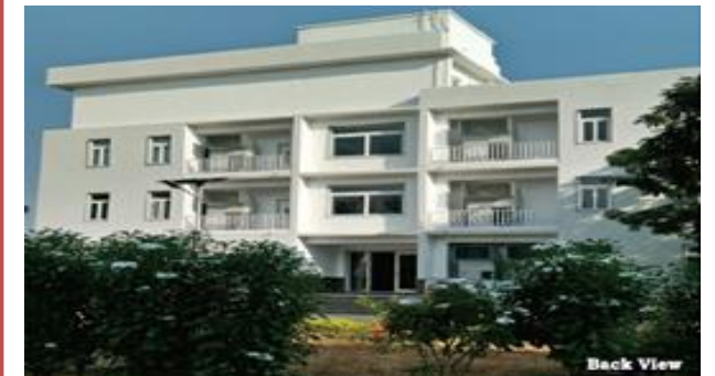
R&E Hub Back View

The National award for Excellence in Research is designed to encourage and recognize outstanding researchers in their field and who have made a significant contribution in advancing knowledge and research outcomes. Faculty members from technical institutions with outstanding accomplishments in research are eligible to apply for the award. Faculty members preferably have to be nominated by their Institute for this award. Self-nominations are also accepted. One award will be given in each discipline. Nominations must be submitted electronically to director_randd@cbit.ac.in no later than 5 p.m. Monday, August 16, 2021. No nominations will be accepted after the deadline. Evaluations will be based on persuasiveness of arguments for merit and evidence of the nominee's accomplishments. Each candidate will be rated on criteria relevant to their discipline. Examples such as articles, books, research grants, patents, citations, H-index, i-10 index, fellowships, key roles in significant projects, national/international awards, prizes, monographs, invited/keynote presentations at major national/international meetings and at other universities, and other research funds. The decision of the CBIT expert committee is final. No correspondence in this regard will be entertained. Registration as per registration structure is a must.