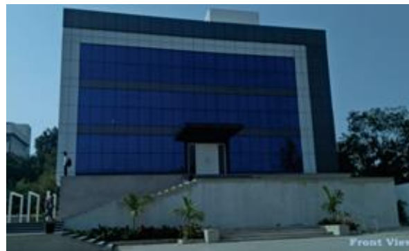
R&E Hub Front View

Each of the Participants interested to showcase their work should submit an Abstract of the Research Papers not exceeding 300 Words in the prescribed format available in the registration form and submit the same on or before 16 August 2021. Exciting Prizes will be awarded to the best Research Papers under various Categories. For details please visit the Website: www.cbit.ac.in