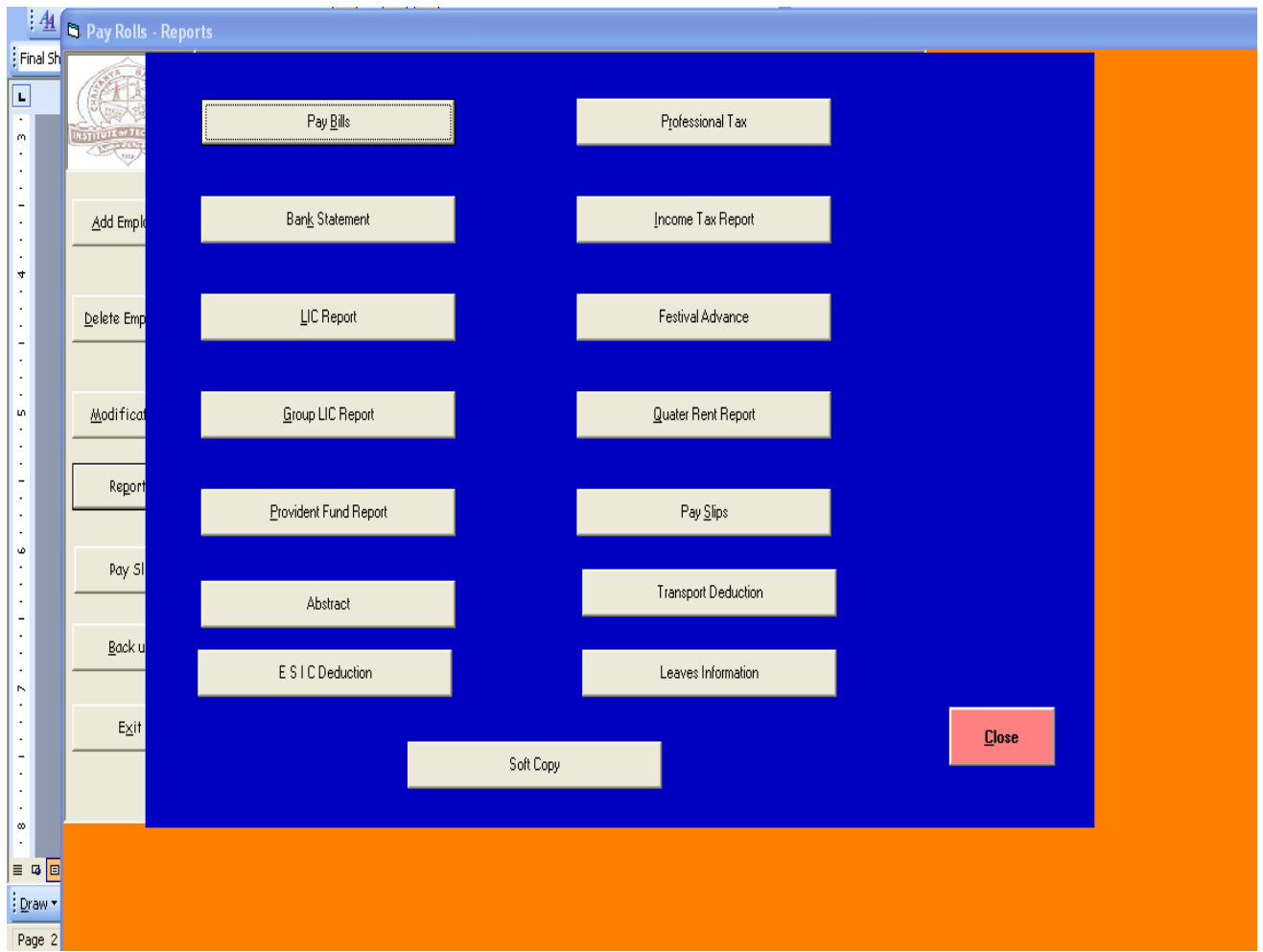
Different tabs of the Software Package