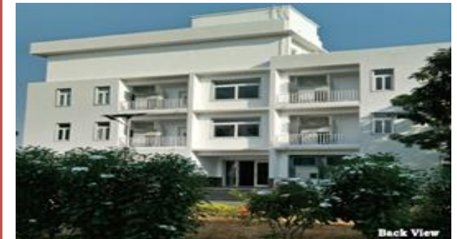
R&E Hub Back View