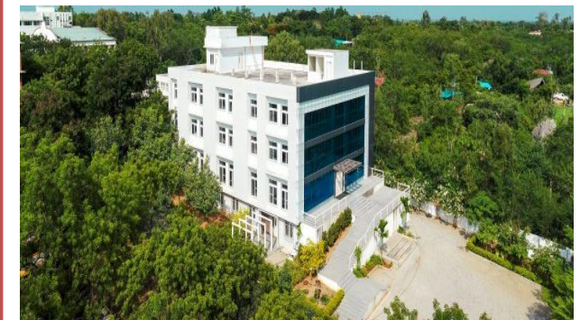
R&E Hub Top View